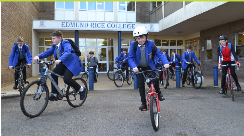
Edmund Rice College always have a great turn-out for their active travel days

We are currently working with over 280 schools across Northern Ireland. Please visit our website where you can learn more about the programme and download newsletters from other areas.