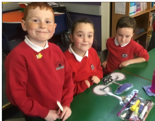
'Build a bike' lesson with P5/6 at Cairncastle PS—not as easy as it sounds