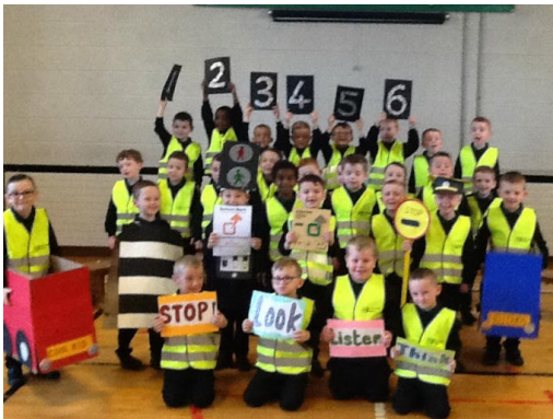
Sacred Heart Primary's P2 class assembly all about road safety