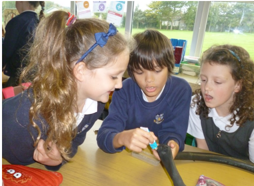
P5 pupils at Whitehead Primary can now fix a puncture