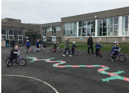
Learning to cycle without stabilisers at Mercy PS

Even as the weather turns colder, there have still been plenty of activities happening in schools—both inside and out. In case you need some inspiration for next term, here are some snapshots of what's been going on.