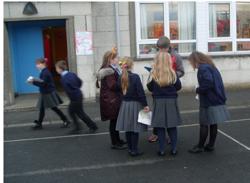
Orienteering in the playground at Carrick Central PS