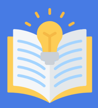
Show an interest in what your child is learning in school...